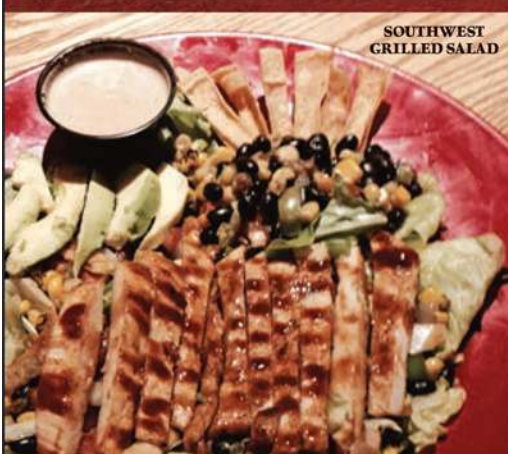
SOUTHWEST GRILLED SALAD

Topped with onions and jalapeño peppers. 9.99